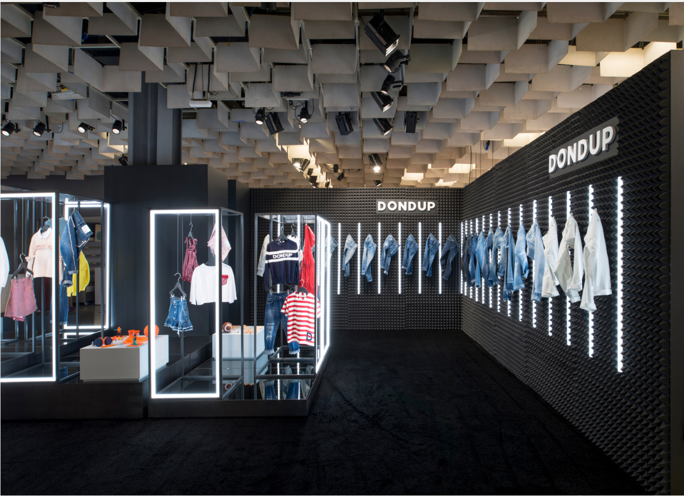
Pitti Bimbo Booth Design